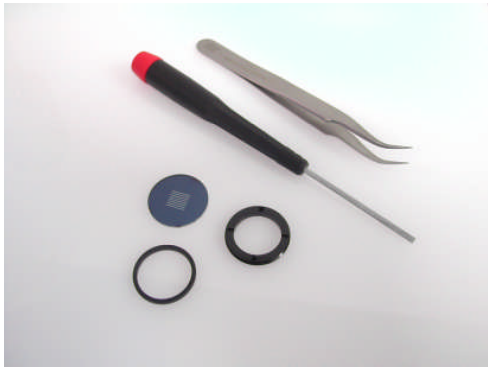
Tools: small screwdriver or tweezers