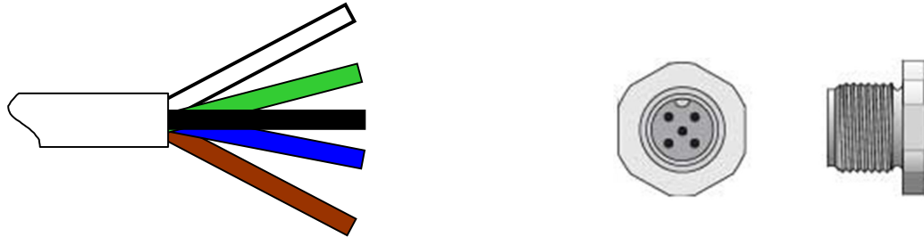
Standard M12 5 Pin cable with Euro color code